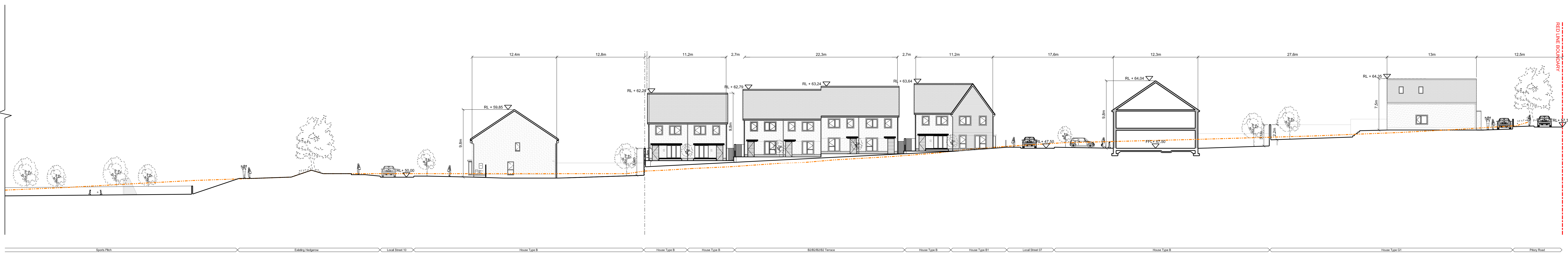
Section BB (Part 2) Scale:1:200